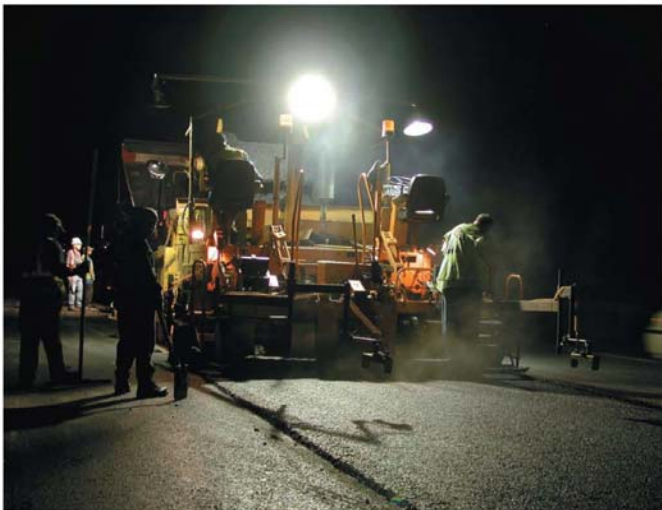
Night paving operation in progress.