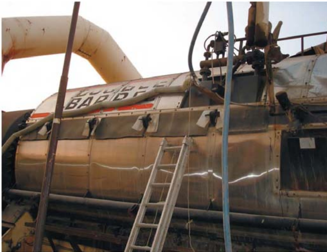
Fiber and sasobit are being fed into the mix.